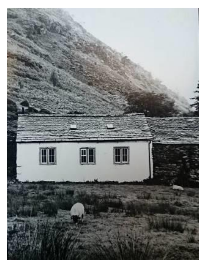
Figure 1: South-east elevation of the meeting house before extension, 1976.

In 1977 an extension to the south-west elevation of the meeting house was constructed by volunteer builders to provide accommodation for a caretaker (later used to provide kitchen facilities).