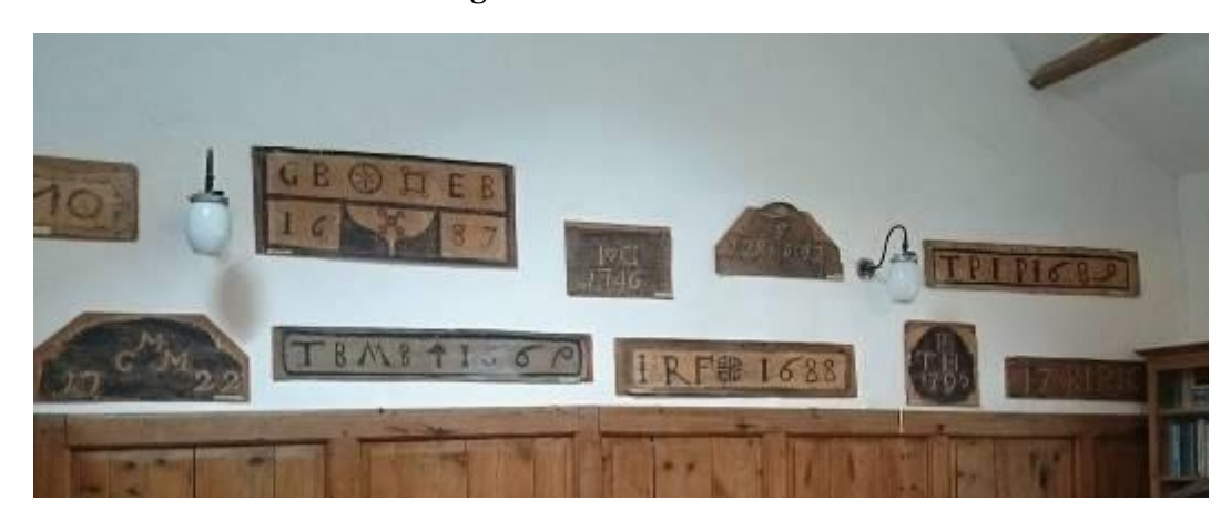
Figure 3: Rubbings of lintels from former Quaker houses on the west wall.

The interior of the meeting room is rectangular in plan, and entered from the south-west end. The floor is stone flagged and the south-west wall is of exposed stone, other walls are plastered. The 3-bay roof has two tie-beam roof trusses the north-west ends supported on two sandstone Doric columns; the outrigger beyond is an extension of 1702 (Fig.2). The room is lit by two rooflights and 3 windows to the east which still retain the original chains for the shutters (which now no longer exist), and handmade paraffin lamps. The elders' stand to the north-east has pine fielded panelling behind the fitted bench, and a balustrade of splat balusters with central steps and handrails. On the wall above are several rubbings of door lintels from former Quaker houses in the area (Fig.3). Fixed benches include one (Fig.4) with no back rest fixed to the meeting room floor.