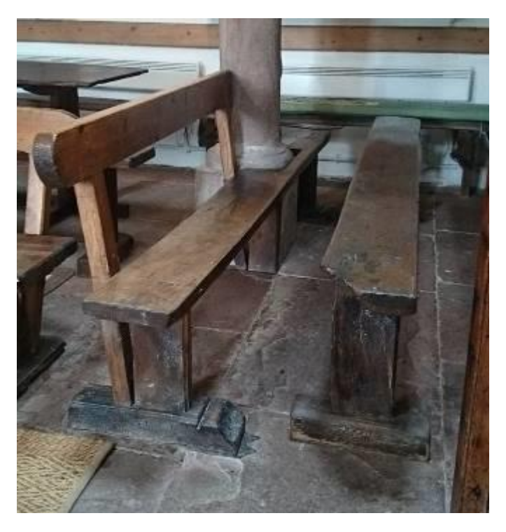
Figure 4: Original fixed historic bench (Right).

An internal doorway leads into the eighteenth century extension from the south-west corner; this space is roughly rectangular in plan and now provides for the cloak room and WCs. The small area between this space and the modern extension contains a plaque with the initials of all those who helped with the extension.