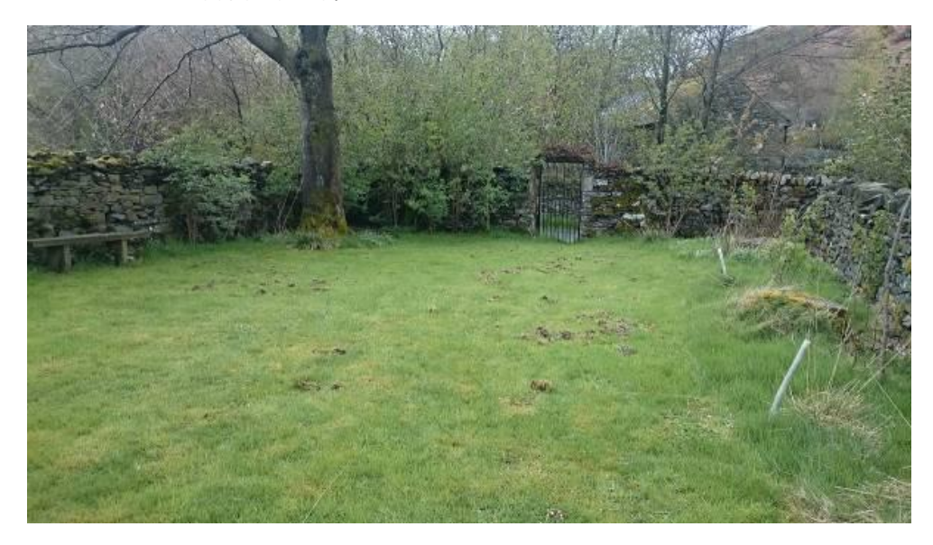
Figure 5: Detached burial ground

wall between the burial ground and car park was rebuilt. The burial ground is now regularly maintained. (NGR: NY 35731 32239).